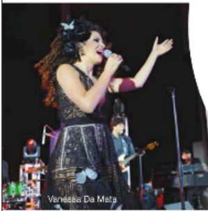
Vanessa Da Mata